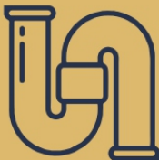
Concealed Plumbing & Electric