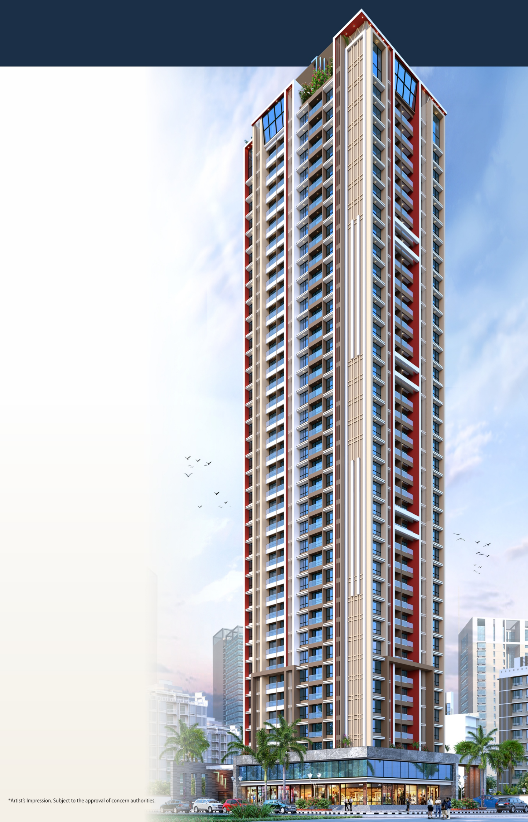
*Artist's Impression. Subject to the approval of concern authorities.