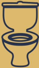
Elegant designed toilets