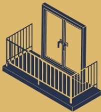
Good Quality Fabrication

*Artist's Impression, Not the actual offering.